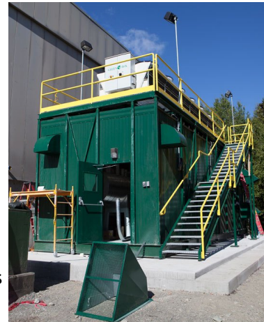
New ice-making equipment installed as part of the renewal of the WFSC.